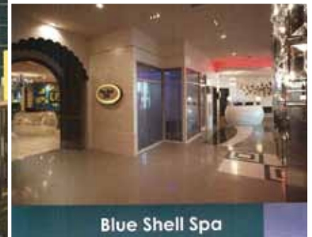
Blue Shell Spa